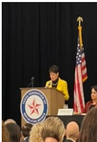
Senator Donna Campbell