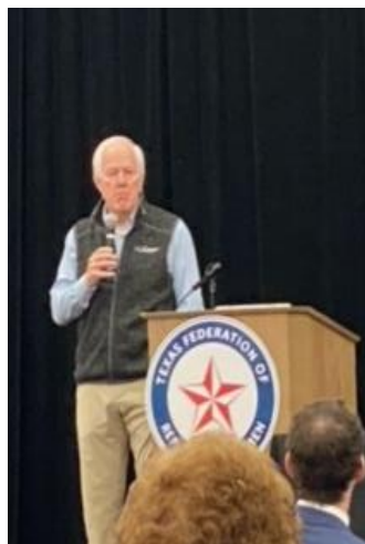
Senator John Cornyn